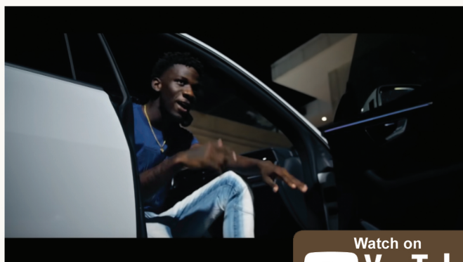
Hartbreak - Goin' Fed