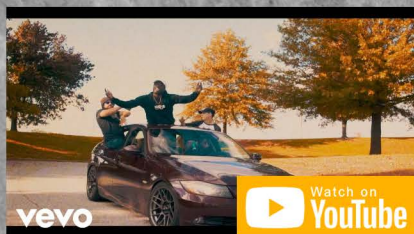
Da Kid Emm "Take A Pic"