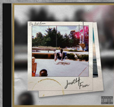
Da Kid Emm "Just 4 Fun" (EP)