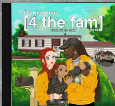
Da Kid Emm "4 The Fam" (EP)